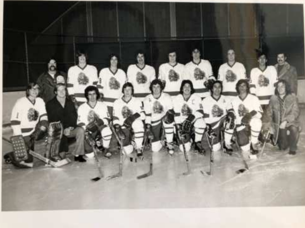
The 1974-75 CCNY Beavers